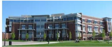
Joe Crowley Student Union (# 087)