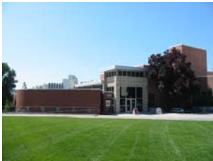
The Overlook Food Court (# 048)

The Overlook Food Court Jot Travis Building (775) 327-5077