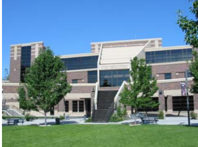
Fitzgerald Student Services Building (# 082)

University Police Services Fitzgerald Student Services, First Floor (775) 784-4013 Emergency 911