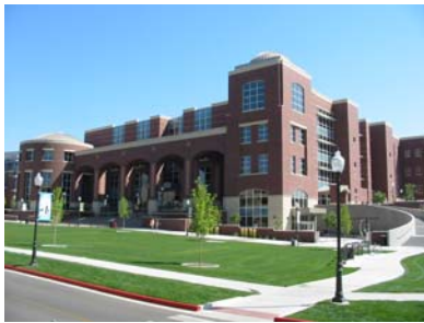
Mathewson / IGT Knowledge Center (# 085)

Bytes Cafe Mathewson / IGT Knowledge Center (775) 784-4174