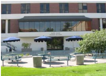
Ansari Business Building (# 063)

Las Trojes Express Ansari Business Building (775) 784-4550