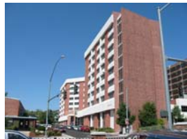
Argenta Hall (# 008)

Jolt-n-Java In Front of the Getchell Building (775) 784-1304